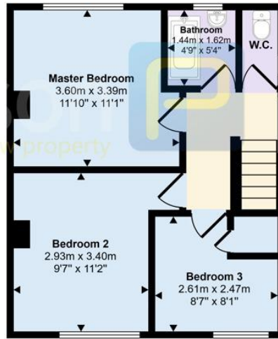
First Floor Approx 39 sq m / 425 sq ft

This floorplan is only for illustrative purposes and is not to scale. Measurements of rooms, doors, windows, and any items are approximate and no responsibility is taken for any error, omission or mis-statement. Icons of items such as bathroom suites are representations only and may not look like the real items. Made with Made Snappy 360.