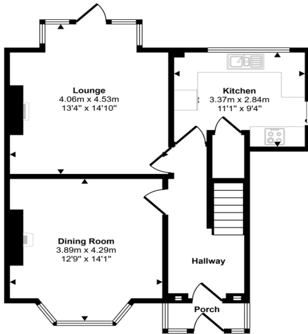
Ground Floor Approx 54 sq m / 576 sq ft

Approx Gross Internal Area 101 sq m / 1089 sq ft