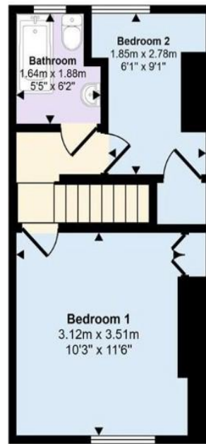
Second Floor Approx 26 sq m / 282 sq ft

This floorplan is only for illustrative purposes and is not to scale. Measurements of rooms, doors, windows, and any items are approximate and no responsibility is taken for any error, omission or mis-statement. Icons of items such as bathroom suites are representations only and may not look like the real items. Made with Made Snappy 360.