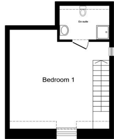
Second Floor Floor area 27.6 sq.m. (297 sq.ft.)

Total floor area: 95.2 sq.m. (1,024.7 sq.ft.)