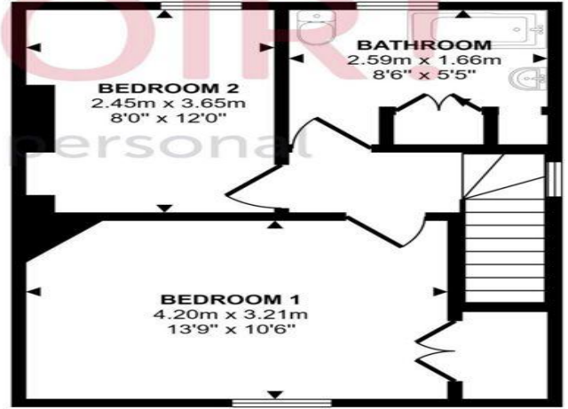
First Floor Approx 36 sq m / 389 sq ft

This floorplan is only for illustrative purposes and is not to scale. Measurements of rooms, doors, windows, and any items are approximate and no responsibility is taken for any error, omission or mis-statement. Icons of items such as bathroom suites are representations only and may not look like the real items. Made with Made Snappy 360.