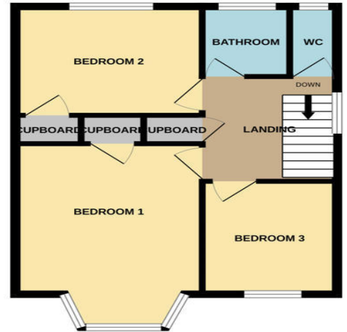
3 BEDROOM SEMI

Whilst every attempt has been made to ensure the accuracy of the floorplan contained here, measurements of doors, windows, rooms and any other items are approximate and no responsibility is taken for any error, omission or mis-statement. This plan is for illustrative purposes only and should be used as such by any prospective purchaser. The services, systems and appliances shown have not been tested and no guarantee as to their operability or efficiency can be given. Made with Metropix ©2026